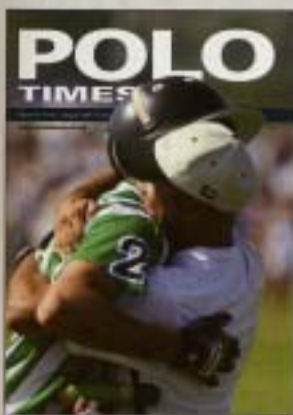
Front Cover: Celebrating a victory at the Gold Cup by Alice Glaze